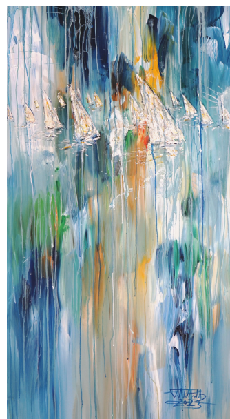
155 x 85 cm Sail Boats L 3 2490,- USD