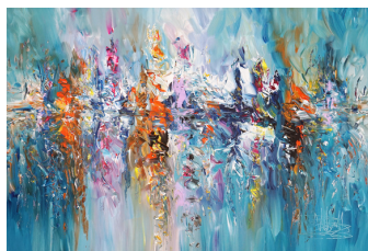
155 x 105 cm, Seaside Rendezvous XL 17 2590,- USD

The diverse impressions of the North and Baltic Seas inspire my abstract maritime paintings, which I have been painting regularly since 2017. I paint some motifs such as "Seaside Rendezvous" in many variations; the motif is available in different formats and different colors. There are also some new motifs being added, like this year "Sail Boats" or "Sailing Adventure".